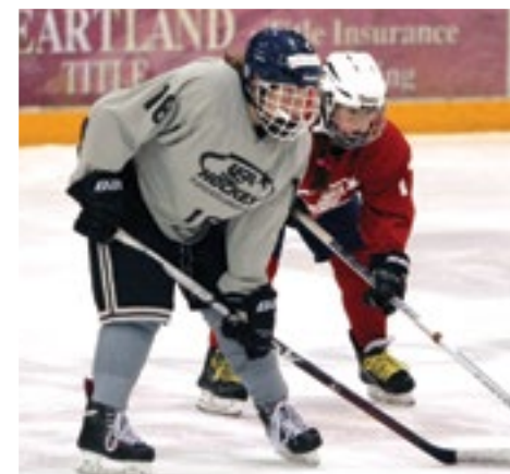
Players face off during game at Girls Player Development Camp

If I am not selected to attend one of the National Player Development Camps, should I attend my District Tryouts next year? Yes. USA Hockey encourages players to continue to attend District Tryouts and Player Development Camps to obtain valuable resources that she can apply to her future development and improvement as a hockey player. Recognizing the importance of long-term athlete development is a critical component to players putting themselves in the best position to reach their goals.