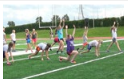
Players during off-ice training at 16/17 Camp

USA Hockey plans to further enhance its scouting and evaluation process and will continue to track each individual player who advances to any of the Girls National Player Development Camps and particularly those who earn return invitations. While a District Tryout is the best way for USA Hockey to evaluate players and compare players' abilities among the best in each District, USA Hockey also works to evaluate players and scout games throughout the hockey season. USA Hockey values effort and improvement.