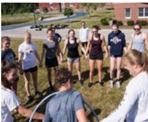
Girls at U18 Select Player Development Camp participate in team building competition

If I have been selected or named as an alternate for one of the Girls National Player Development Camps, but I have an extenuating circumstance (emergency, injury, sickness, etc.) that prohibits or may prohibit me from attending the camp, who should I contact? A player who has been selected or named as an alternate, but has an extenuating circumstance that prohibits or may prohibit (i.e. unsure if player will be cleared from an injury), the player should notify USA Hockey's National Office and her District Girls Council Representative of the circumstances immediately.