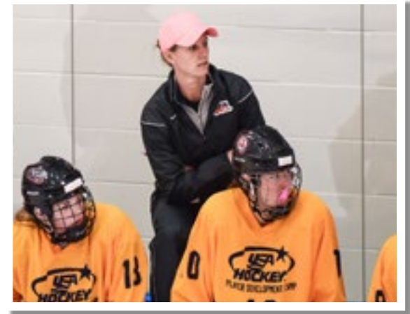
Three-time Olympian, Kacey Bellamy

While playing for a competitive collegiate program is a goal for most players who attend National Player Development Camps, USA Hockey also understands the overarching goal and dream of each player is to play for Team USA on an international level. It is important to note the average age of a player on the 2022 U.S. Women's Olympic Team was 25.9 years of age (7 years of development beyond the oldest U18 birth year). Recognizing the importance of long-term athlete development is a critical component to players putting themselves in the best position to reach their goals.