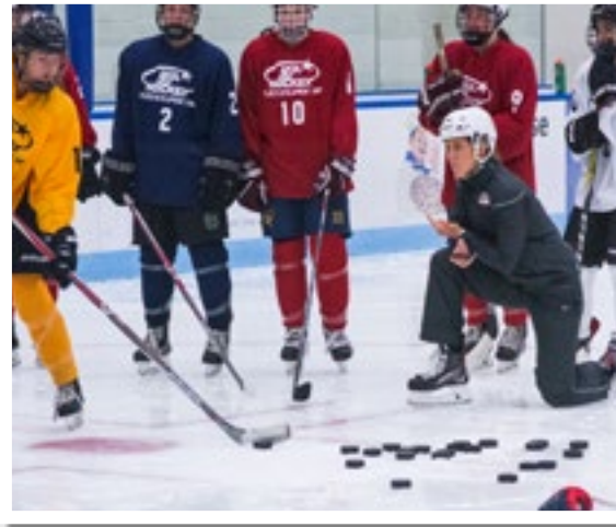
Three-time Olympian, Meghan Duggan on the ice with U18 Select Players

No. A player must have proof of her U.S. Citizenship in order to be eligible for Girls National Player Development Camps. However, some Districts may allow a non-U.S. citizen in this scenario to attend a District opportunity (tryout or camp) under the condition that she is ineligible for potential advancement to any of USA Hockey's Girls National Player Development Camps.