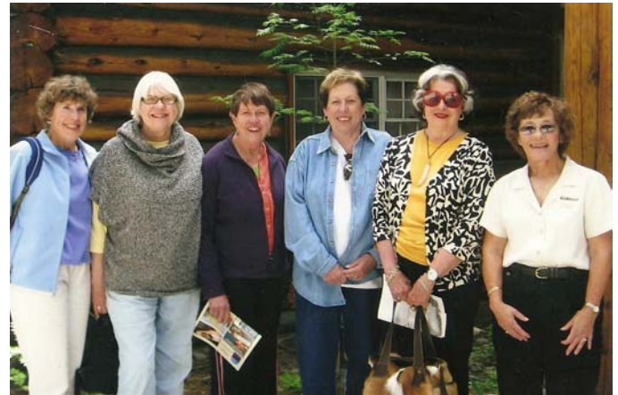
Remembering Girl Scout days—Class of 1958

Reunion announcements start on page 3 of this issue.