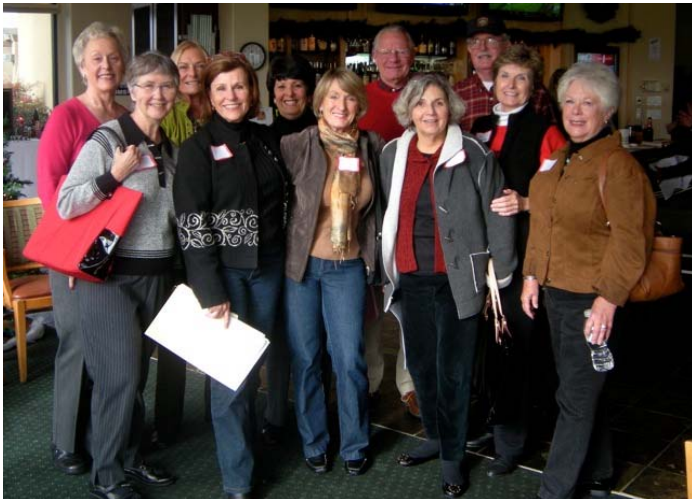
Class of 1960 50 th Reunion Planning Committee