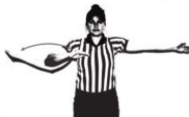
EARLY ENTRY ON DRAW