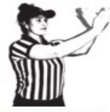
OBSTRUCTION OF FREE SPACE TO GOAL