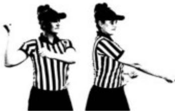
DANGEROUS FOLLOW THROUGH & DANGEROUS PROPELLING