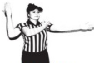
ROUGH CHECK/ ILLEGAL CHECK ON BODY