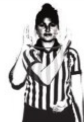
ILLEGAL CRADLE IN SPHERE