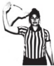
CHECK TO THE HEAD