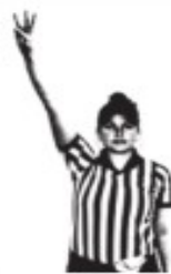
THREE SECOND RULE