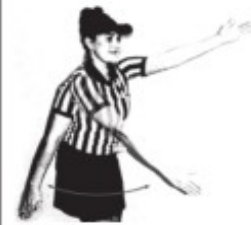
GOAL CIRCLE FOUL