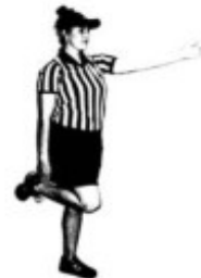
ILLEGAL BALL OFF THE BODY