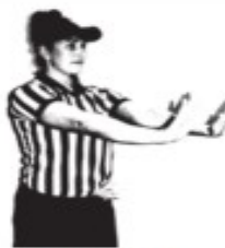
PUSHING OR BODY CONTACT