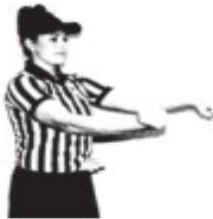
ILLEGAL STICK TO BODY CONTACT