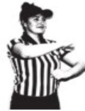
ILLEGAL PROCEDURE/ FASE START