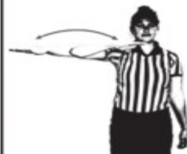
10 SECOND GC COUNT