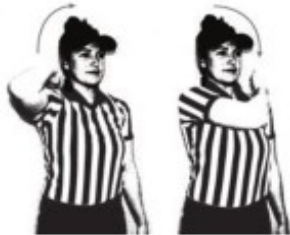
CROSSE INTO/ THROUGH SPHERE