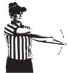
EMPTY CROSSE CHECK