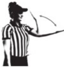
DANGEROUS SHOT ON GOALKEEPER